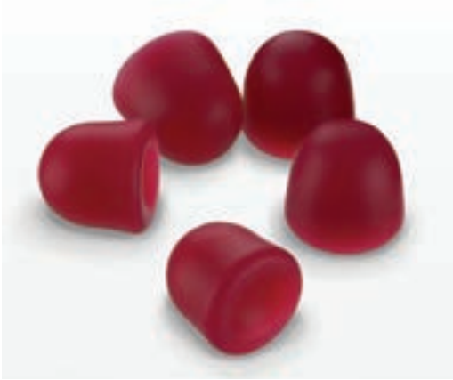
DOMES 2.0 - 4.0 G