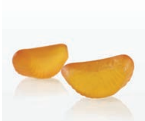
ORANGE SLICE 2.4 - 3.0 G